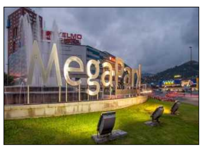
Centro comercial Megapark Barakaldo

situación de inestabilidad e incertidumbre que ha vivido el mercado español en ese periodo". "Además - añadió -, es una clara muestra de la eficiencia de las medidas puestas en marcha para mejorar los activos". Entre estas medidas se encuentran la redistribución de espacios, el aumento de la tasa de ocupación, las obras de rehabilitación y la renegociación de alquileres.