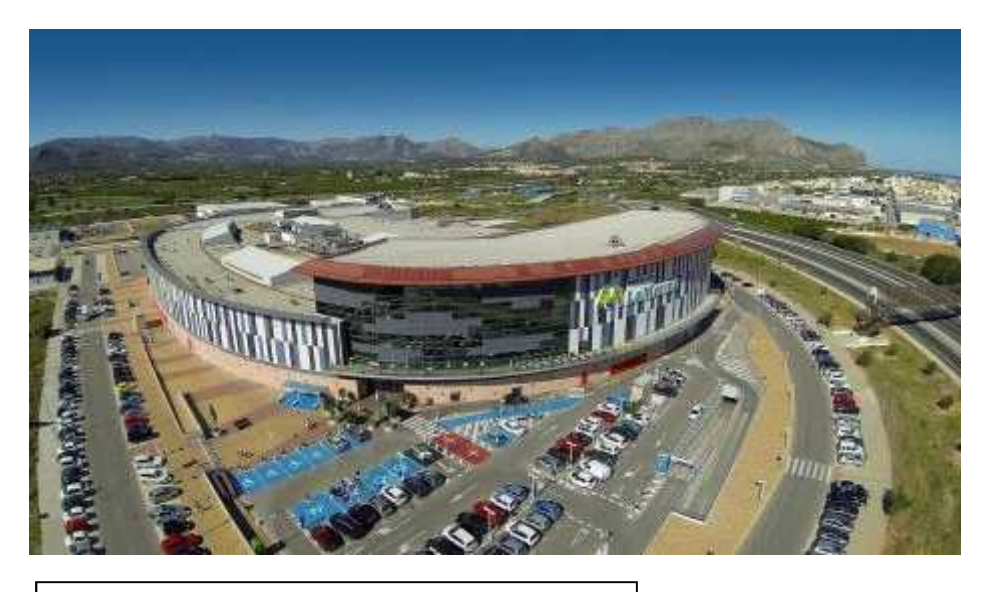
Centro comercial Portal La Marina

Por tipo de activos, los centros comerciales han alcanzado una revaloración del 7,5%, frente al 4,4% de finales de 2015; el valor de las oficinas ha aumentado el 13,7% - 6,6% a diciembre del pasado año -; el de los centros de logística se incrementó el 14,1% - 11,1% en el cálculo anterior - y el activo residencial con que cuenta la SOCIMI se revalorizó el 7,3%, en línea con el porcentaje de finales de 2015 y que fue del 7,1%. La valoración de los activos ha sido elaborada por Cushman & Wakefield y Jones Lang Lasalle.