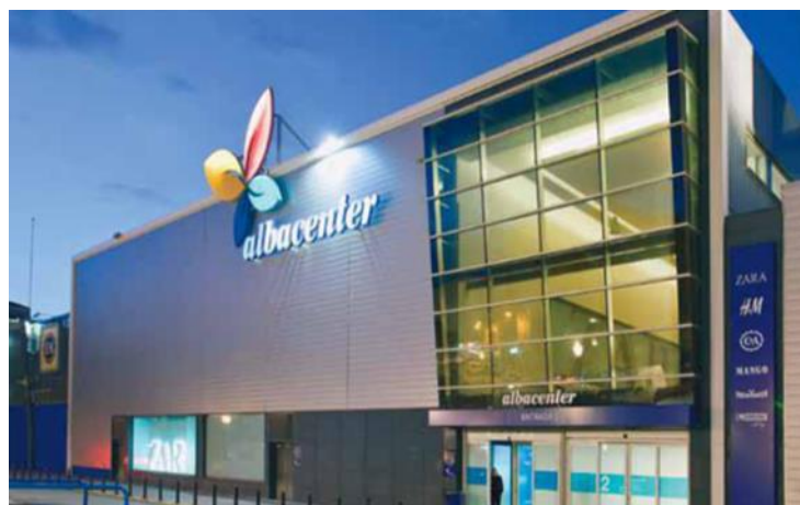
Facade of the shopping center Albacenter

The hypermarket and the two premises are part of the shopping center Albacenter, which was acquired in July of 2014 by the SOCIMI for €28.4 million. This purchase allows LAR ESPAÑA REAL ESTATE to strengthen its position on the asset.