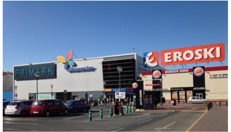
Front view of the hypermarket Eroski