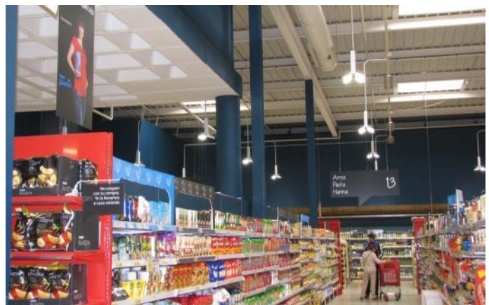
Interior of the shopping center Albacenter