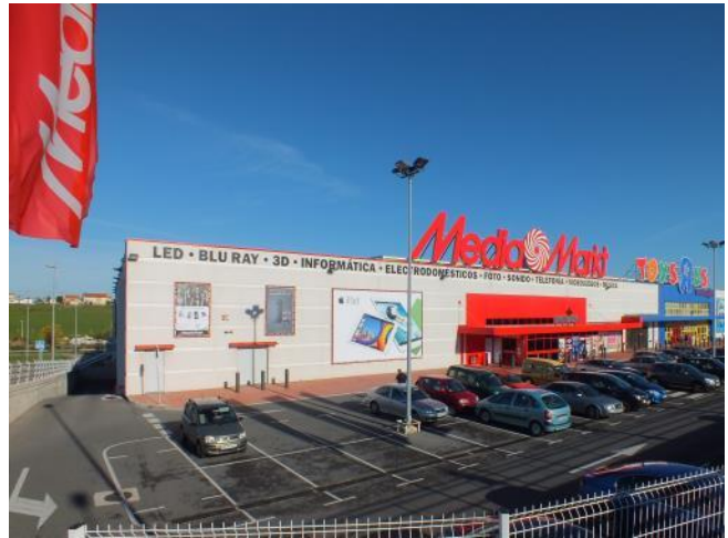
Main entrance and parking area