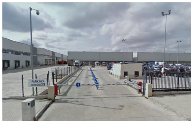
Facade of one of the warehouses

The logistics area consisting of six industrial units has been built on a 152,590 square meters plot and is currently 100% leased to the multinational company Carrefour, a leading French distribution company. The complex has a gross lettable area (GLA) of 83,951 m 2 .