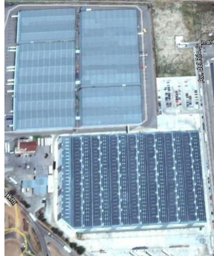
Aerial perspective of the logistic center