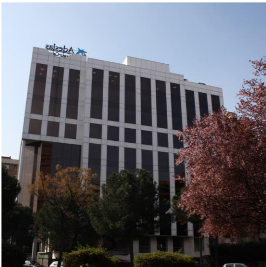
Facade of the Building

This new acquisition of the SOCIMI managed by Grupo Lar comes after the purchase of the shopping centers "Txingudi" in Irún and "Las Huertas" in Palencia last March and the commercial building occupied by Media Markt in Villaverde, Madrid. With this transaction, the total amount invested by Lar España amounts to EUR 72.7 million, 18% of the capital raised in the IPO. It constitutes an off-market transaction that has been fully paid for using company funds.