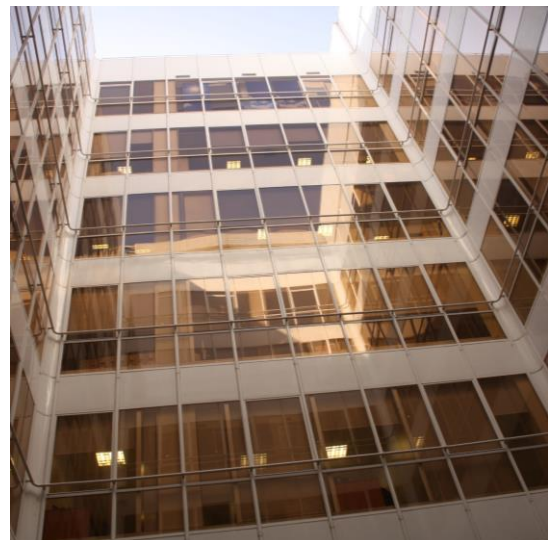
Inside View of the Building