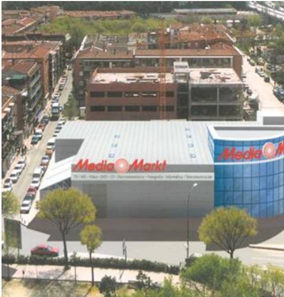
Aerial View of the Commercial Building