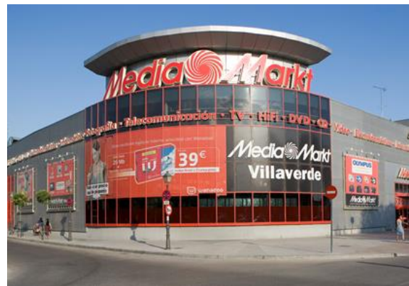
Main Facade of the Commercial Building

The building was constructed in 2002 as part of a turnkey project. Since 2013 it has been leased to Media Markt, the consumer electronics retailer, under a long-term contract. Its state of conservation is suitable, as a result of the reforms carried out in November 2009.