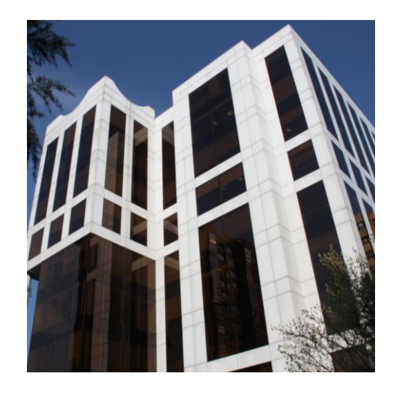
Outside View of the Building

The property has a gross leasable area of 8,663 sqm above ground, distributed over 9 floors and 193 parking spaces. This building is constructed around a wide central courtyard which allows ample light inside and stands out for its design, size and space layout flexibility which enables the optimization for better use of space.